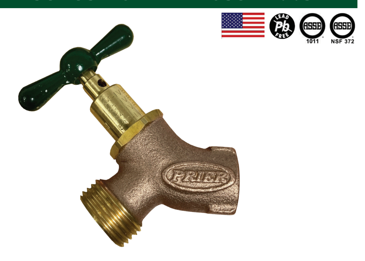
33 Series Lead Free No-Kink Hose Bibbs