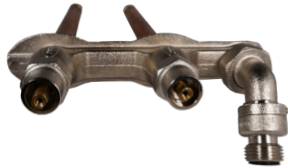
C-208 Loose Key Design

The PRIER C-108 has all the characteristics of the historically proven C-134 with the added protection of a self-draining anti-siphon vacuum breaker and backflow check valve. It is available from stock in lengths from close coupled to 24". Longer sizes are available on request.