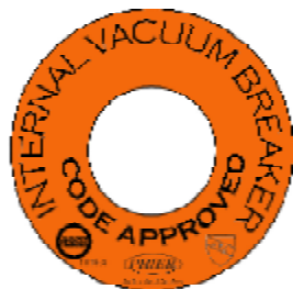
Removable Inspection Collar