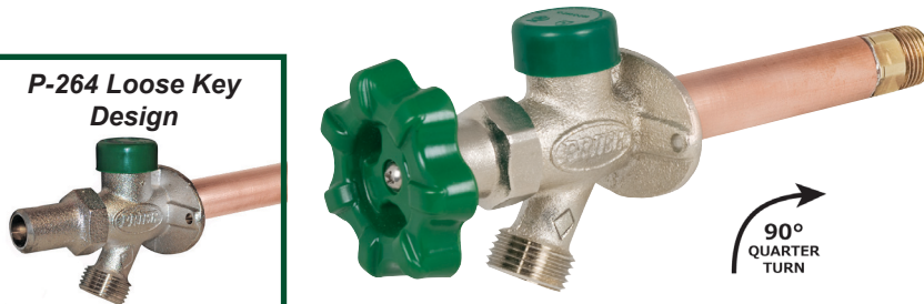
P-264 Loose Key Design