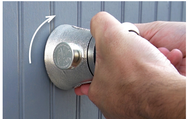
Step 5: Vacuum breaker is at the 9 o'clock position, and the spout is at 3 o'clock