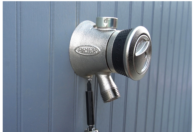
Step 6: Install remaining screw