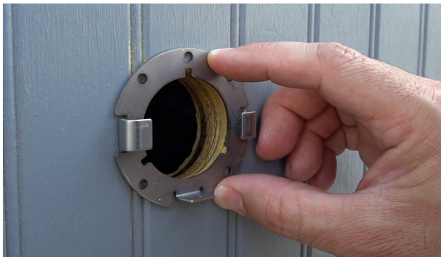
Step 4: Tab with hole positioned at 6 o'clock