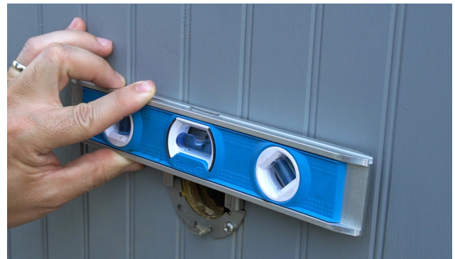
Step 4 cont'd: Ensure mounting bracket is level