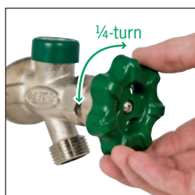
Easy opening, soft-grip, 1/4-turn valve.