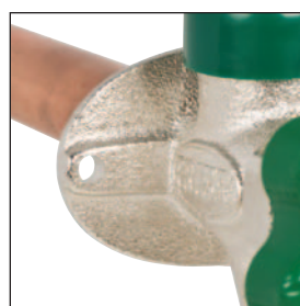
Enclosed screw holes for easy installation.