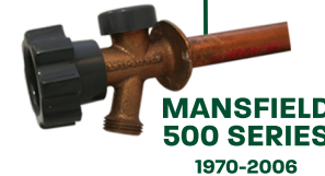
MANSFIELD 500 SERIES 1970-2006