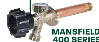
MANSFIELD 400 SERIES 2006-PRESENT